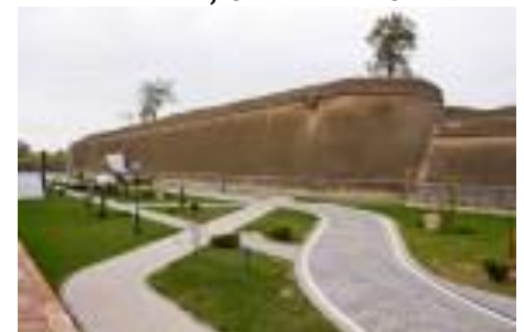
Alba Carolina fortress