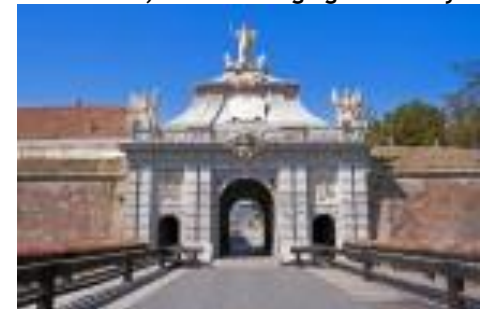
Alba Iulia, Citadel's 1st Gate