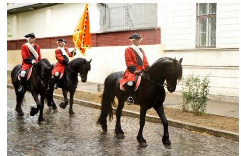
Alba Iulia, Guard Changing Ceremony