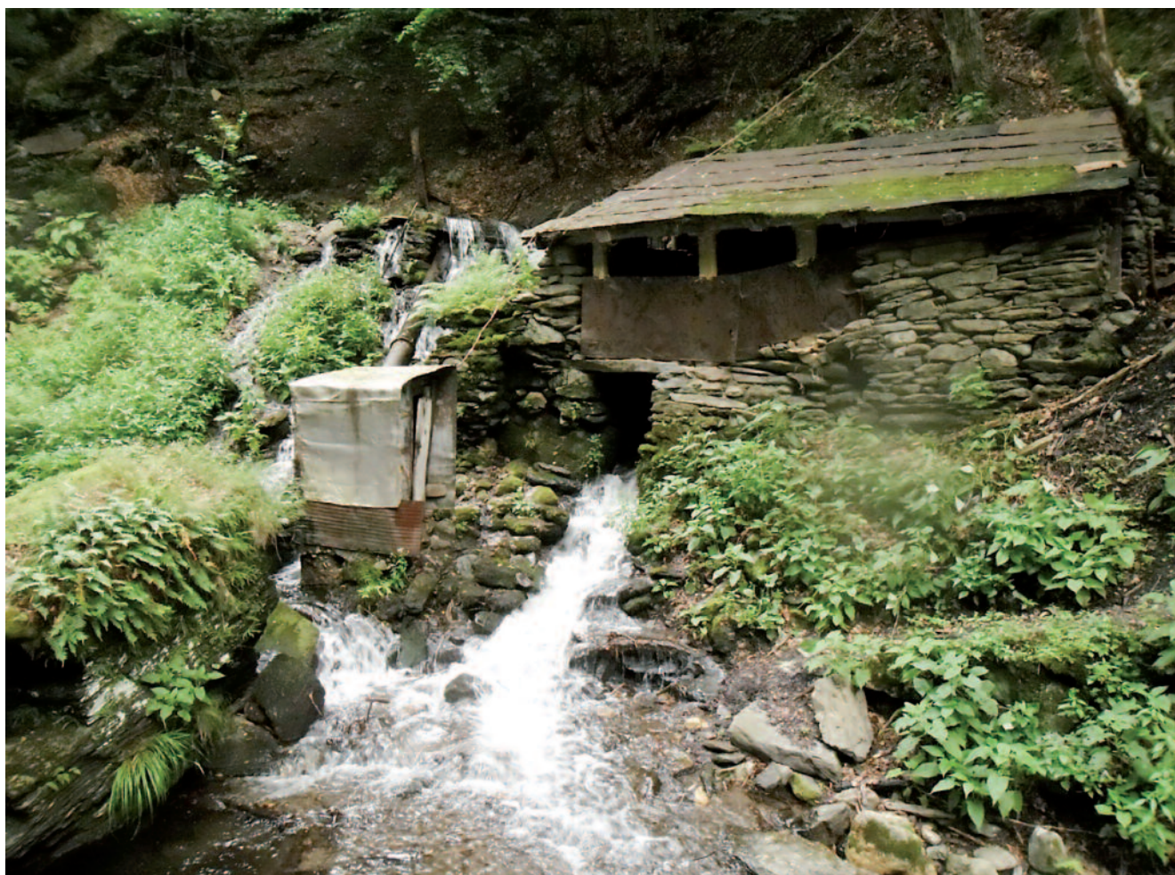
Figure 1: Transylvanian Watermill

One of the results of these enthusiastic nature lovers work was the construction of the present-day Natural History Museum of Sibiu ( http://www.brukenthalmuseum.ro/naturale_en/ ) in the late 19th Century, an exquisite Italian Renaissance building on three levels which house, conserve and protect natural history collections comprising over one million items of priceless value. The aquatic and semi-aquatic species of plants, invertebrates, amphibians, fish and mammals are very well represented and constitute an important continuous attraction for researchers all over the world.