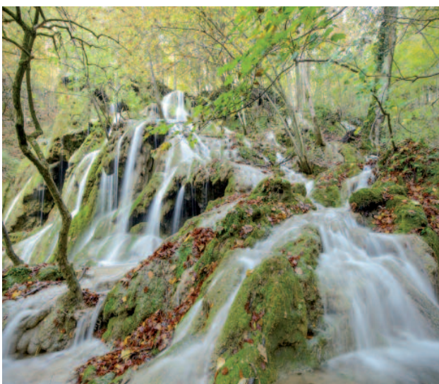
Figure 5: Beuşniţa Waterfall.

As early as 1380, a school was opened serving Sibiu's local and regional intellectual environment, and constituted a landmark for this region. The truth is that the city of Sibiu was permanently motivated by the desire to see its residents