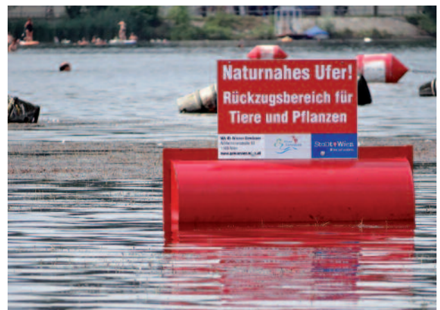
Figure 3: Recreational areas such as public baths and beaches are in the close neighbourhood of habitat zones for animals and plants in the open water and banks. The small space patchiness of alternate zones satisfying both the recreational use and nature protection of urban wild life is most probably one of the greatest challenges of urban landscape planning (e.g. Hozang, in prep; Pall in prep).