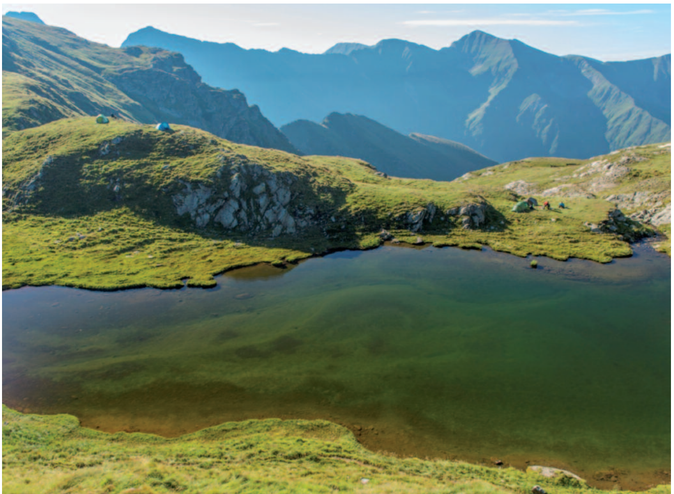
Figure 3: Capra Lake in the Transylvanian Alps.