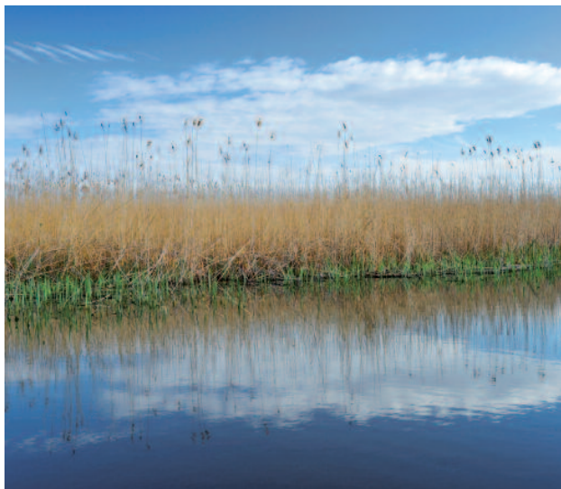
Figure 4: Danube Delta (Photo: Daniel Bălăţat).

Two very fine, large-scale and ancient libraries, the Baron Samuel von Brukenthal Library ( http://www.brukenthalmuseum.ro/biblioteca_en/index.html ) and the Library of the Transylvanian Association for Romanian Literature and Culture of the Romanian People ( http://www.bjastrasibiu.ro/ ), induced and sustained a favourable environment for culture and science in the area. The importance of the naturalist tradition of the city appeared and grew continuously since 1849 through several series of scientific international periodicals such as: Verhandlungen und Mitteilungen – in German, Studii şi Comunicări - in Romanian, Acta Oecologica Carpatica – in English ( http://reviste.ulbsibiu.ro/actaoc/index.html ), Transylvanian Review of Systematic and Ecological Research – in English ( http://stiinte.ulbsibiu.ro/trser/index.html ), etc., all of them totally or partially dedicated to the study of the aquatic environment.