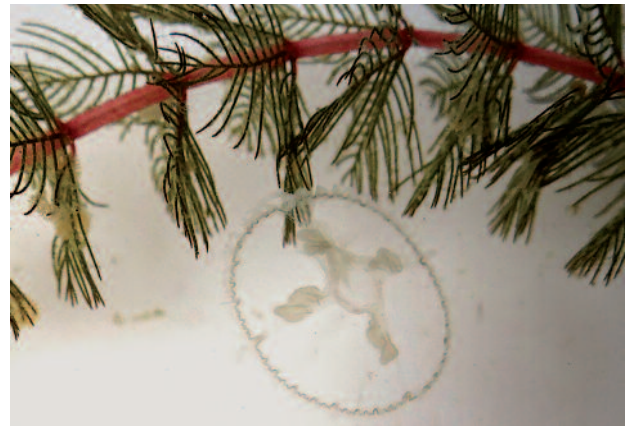
Figure 2: Size comparison between the freshwater jellyfish ( Craspedacusta sowerbii , Fritz et al. 2007) and the submerged water plant Spiked Water-milfoil ( Myriophyllum spicatum ). The frequency of warm summer days with water temperature exceeding 22°C has increased by 10.5 days per decade from 1994 to 2014. Extreme hot summers favour the development of neobiota (Moog et al. 2007, Pall et al 2013) in Alte Donau as e.g. this jellyfish.