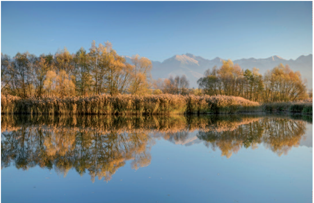
Figure 2: Olt River near the Transylvanian Alps