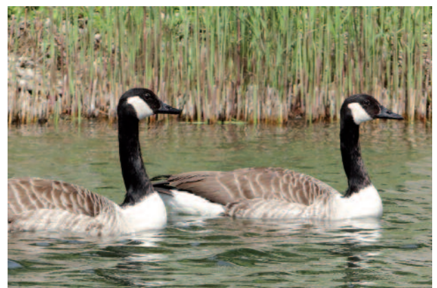
Figure 4: The Canada Goose ( Branta canadensis ) is one of 44 species of water birds found in Alte Donau. Field surveys of water birds were carried out in 1997/98 and 2000/01 (Raab, in prep). Other biota, as e.g. the assemblages of the many microorganisms in the water, for example the algae and water fleas (phytoplankton, zooplankton), were studied in biweekly or monthly sampling intervals for more than 20 years (1993 to 2015) and used for assessing the water quality.