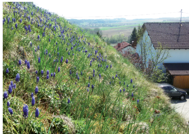
Figure 2: 'Green Roof': insulation against extreme temperature, retention of precipitation