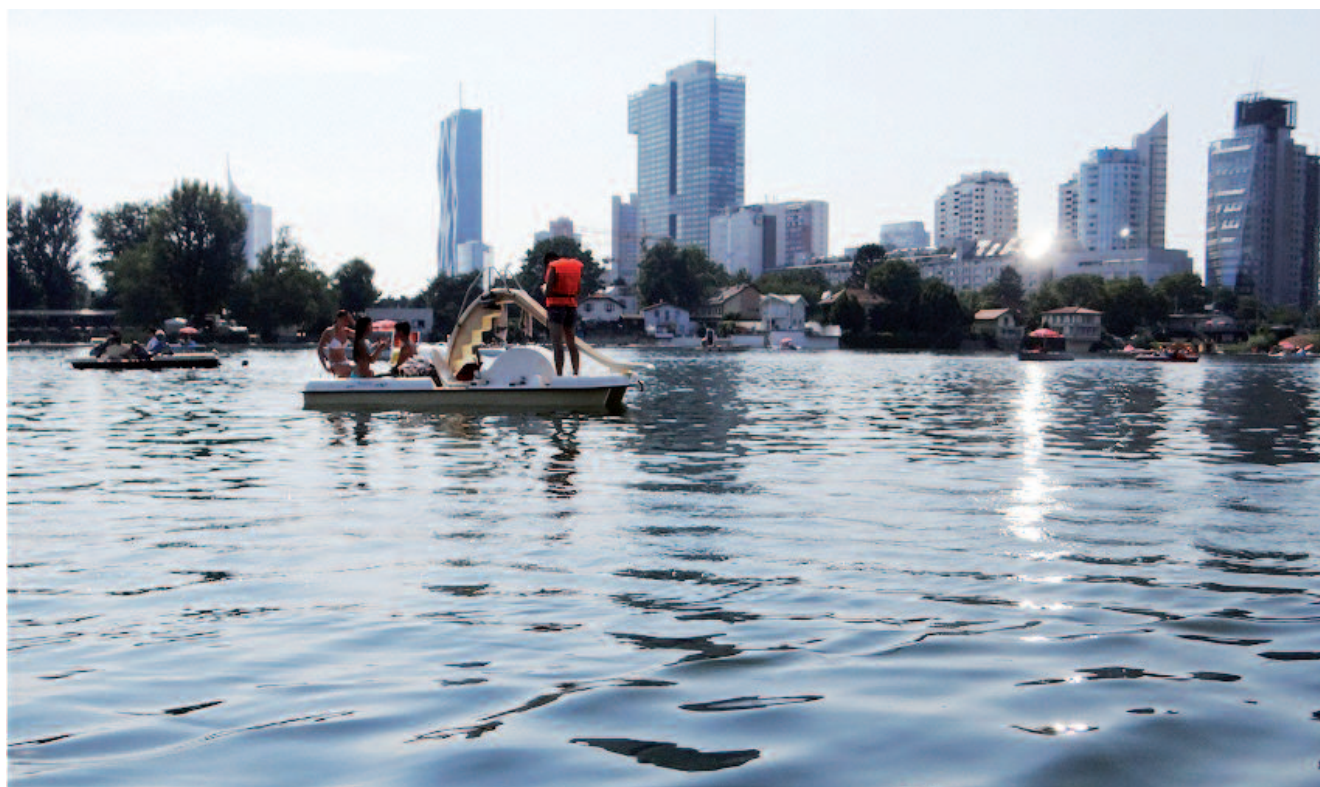
Figure 1: Alte Donau comprises two large main basins, the so called 'Obere Alte Donau' and 'Untere Alte Donau'. The elongated shape of these two basins with an area of 1.5 km 2 refers to the former river branch of the Danube River. The lake and its surrounding parks and restaurants serve as a popular recreational area in the city of Vienna.

oxbow lake had attracted people living in the capital of Austria, Vienna, for many reasons. Besides the economic use of Alte Donau such as for boating, fishery, and poultry farming (goose husbandry), this groundwater-seepage lake has also a long tradition of serving as a popular recreational area (Figure 1). In the eighties, Löffler (1988) summarized ecological surveys ranging from phytoplankton and water plants to fish and water birds. He described this shallow lake as a mesotrophic ecosystem. About five years later the ecosystem changed as the nutrient loading increased coinciding with the strong reduction of the submerged vegetation cover (Donabaum et al. 1999, Dokulil et al. 2000, 2006, 2011). At that time Alte Donau was shifting from a macrophyte clear-water state to the state of a turbid water body with heavy phytoplankton blooms (Scheffer and van Nes 2007, Jeppesen et al. 2010). The lake's situation became particularly critical as the phytoplankton bloom was largely due to Cylindrospermopsis raciborskii (Mayer et al. 1997, Dokulil 2015). This